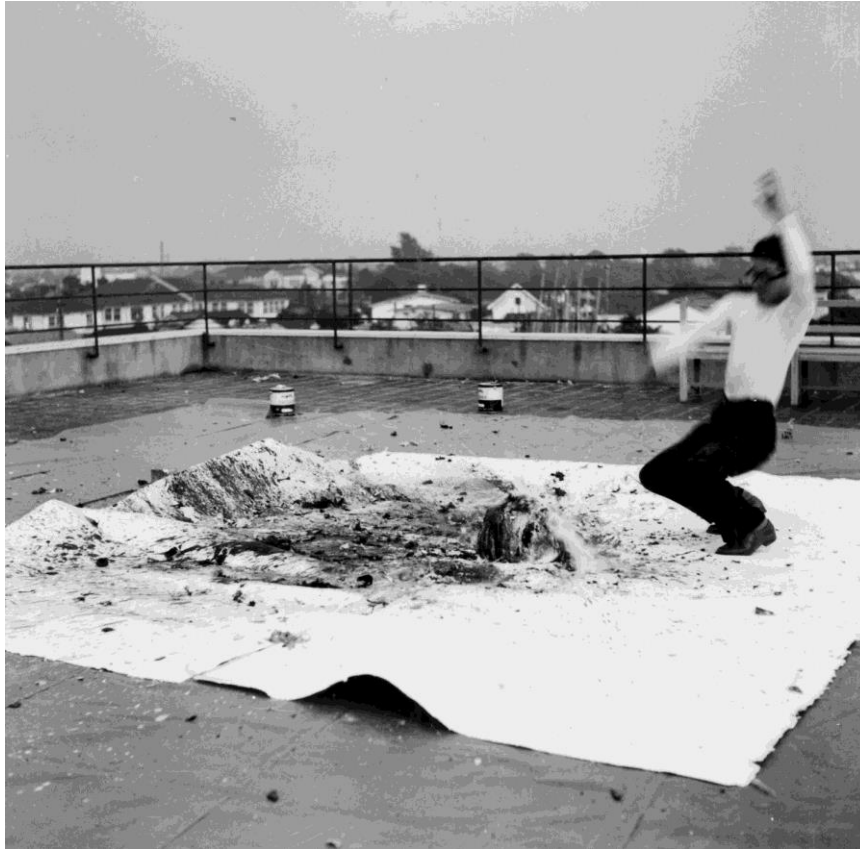
Shimamoto's live performance at the 2nd Gutai Exhibition, Ohara Kaikan, Tokyo, October 1956 © Osaka City Museum of Modern Art GA1707

“Embody the fact that our spirit is free. The thing that is most important to us is that contemporary art acts as a free space providing maximum release for people to survive the trying conditions of contemporary life. It is our deep-seated belief that creativity in a free space will truly contribute to the development of the human race.”